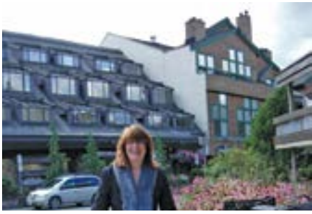
My 25th Notary Anniversary at Whistler

I became a BC Notary 30 years ago, commissioned at the age of 10—the youngest Notary ever! I had worked for law firms since leaving school and liked real estate and mortgage work immensely. As a paralegal mainly in small firms, I was used to taking the files from start to finish. We would even attend on execution of the documents at that time. I was often in the office 10 hours a day. Dealing with the clients was especially rewarding.