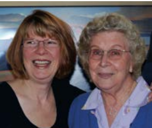
Mom and I

I was born in Mission, BC. My father was a logger so we moved around the province a lot. My mother and father moved to Williams Lake when I was 3 and started the Williams Lake Logging Company.